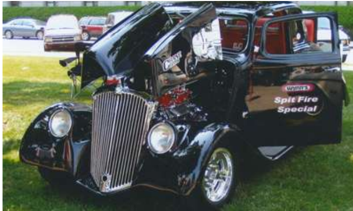
1933 Willy's Model 77