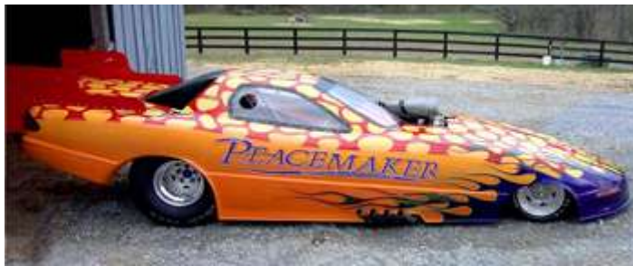
Peacemaker Drag Car