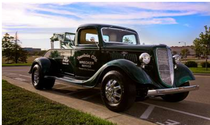
1935 Ford wrecker