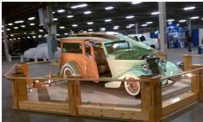
1934 Ford Woody