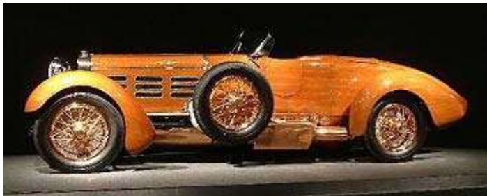
1924 Hispaino Suiza Tulipwood Torpedo 1 of only 3 in existence