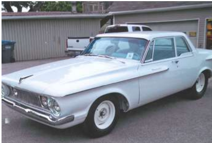
1962 Plymouth Savoy